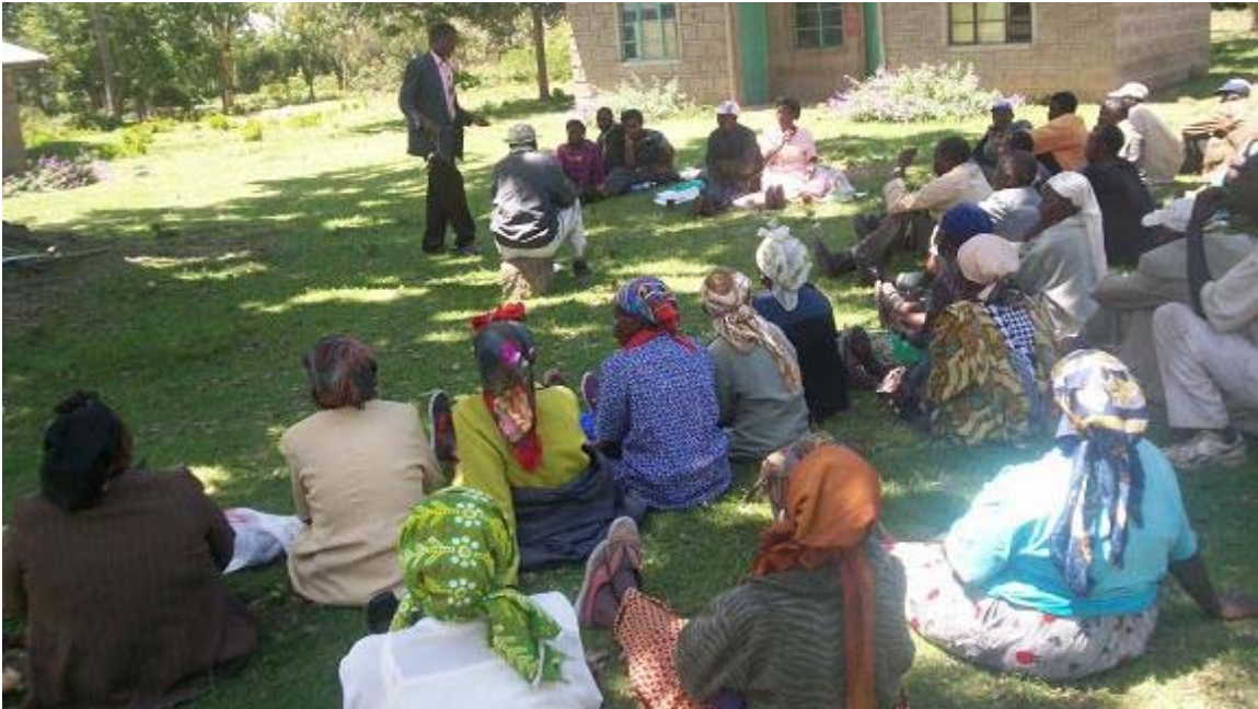
ENGLISH: In house training: Participants attending a local seminar at Matanya area during the month of January.

Nitukoretwo tugithomithia ikundi nini njira njega cia uhandi wa miti na umenyereeri, na urimi mwega. No tukoragwo tukimathomithia njira cia kugetha maai ta kwenja demu na mikaro. Maai macio nimacokaga kuhuthirwo hindi ya riuu hari guitiria miti na irio iria ingi mugunda maai.