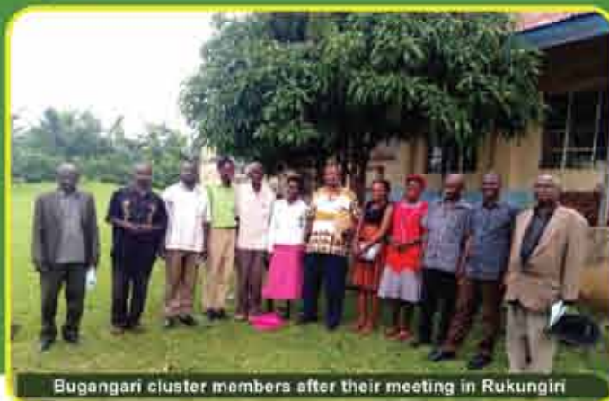
Bugangari cluster members after their meeting in Rukungiri

TIST Uganda Bushenyi Town, Liberation Road - Kitoky Lane P.O. Box 232, Bushenyi, Uganda, East Africa Tel: 0772 058 868 / 0773 716960 / 0772360429 / 0783910878 Website: www.tist.org , info@i4ei.org