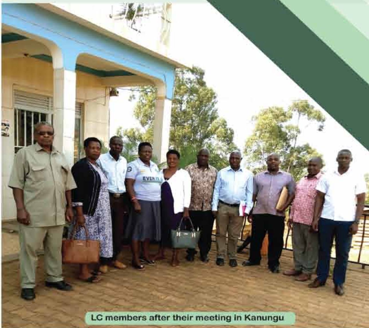
LC members after their meeting in Kanungu

TIST Uganda, Bushenyi Town, Liberation Road - Kitokye Lane