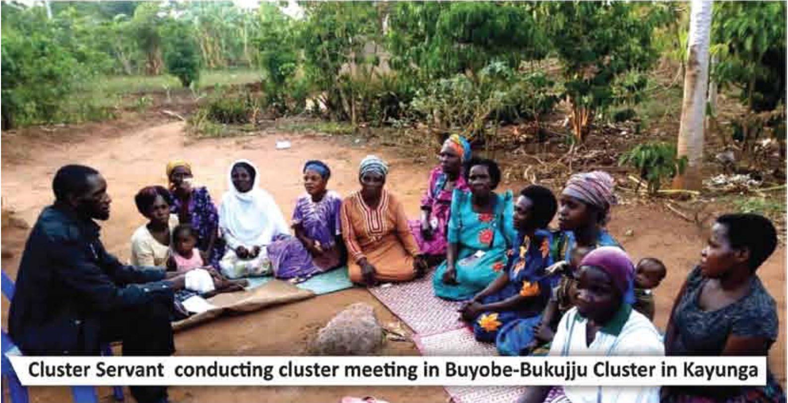
Cluster Servant conducting cluster meeting in Buyobe-Bukujju Cluster in Kayunga

The TREE is a monthly newsletter Published by TIST Uganda, a project area of The International Small Group and Tree Planting Program.